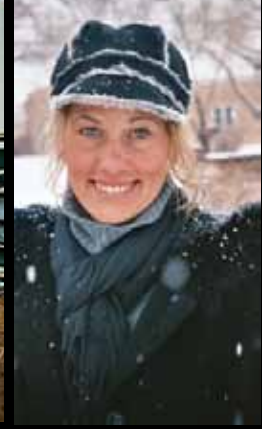
"The Santa Fe Digital Darkroom Photographic Workshops are like summer camp for adults!"